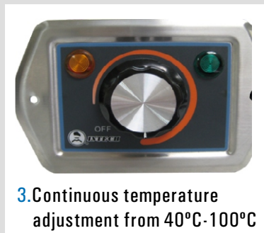
3. Continuous temperature adjustment from 40°C-100°C