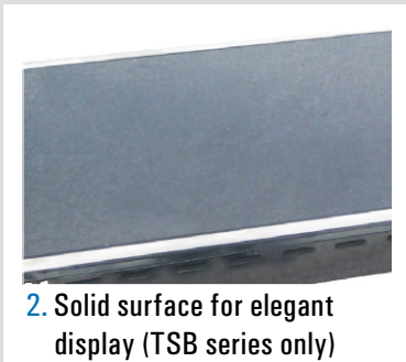
2. Solid surface for elegant display (TSB series only)